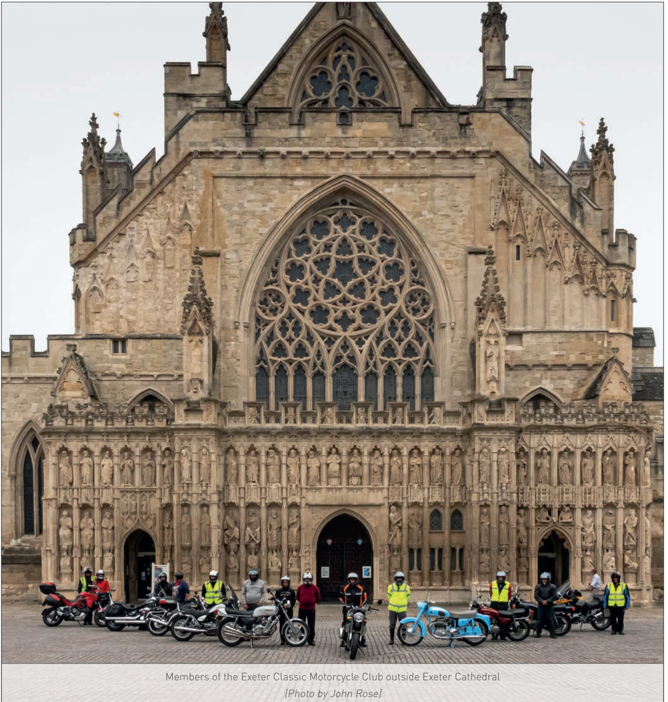
Members of the Exeter Classic Motorcycle Club outside Exeter Cathedral