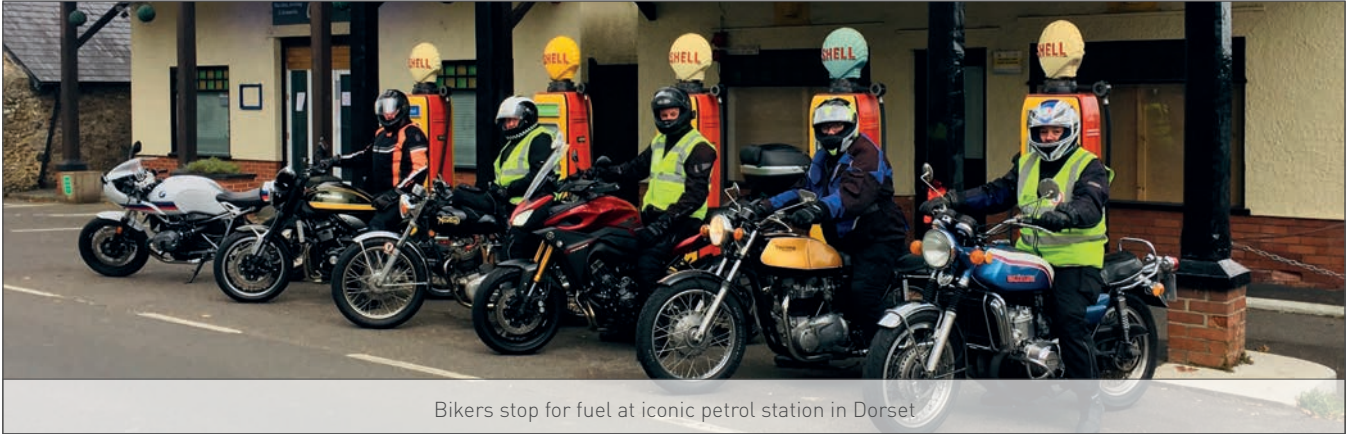
Bikers stop for fuel at iconic petrol station in Dorset