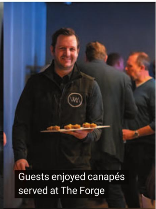
Guests enjoyed canapés served at The Forge