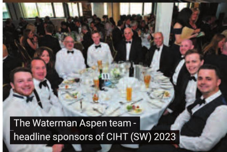
The Waterman Aspen team - headline sponsors of CIHT (SW) 2023