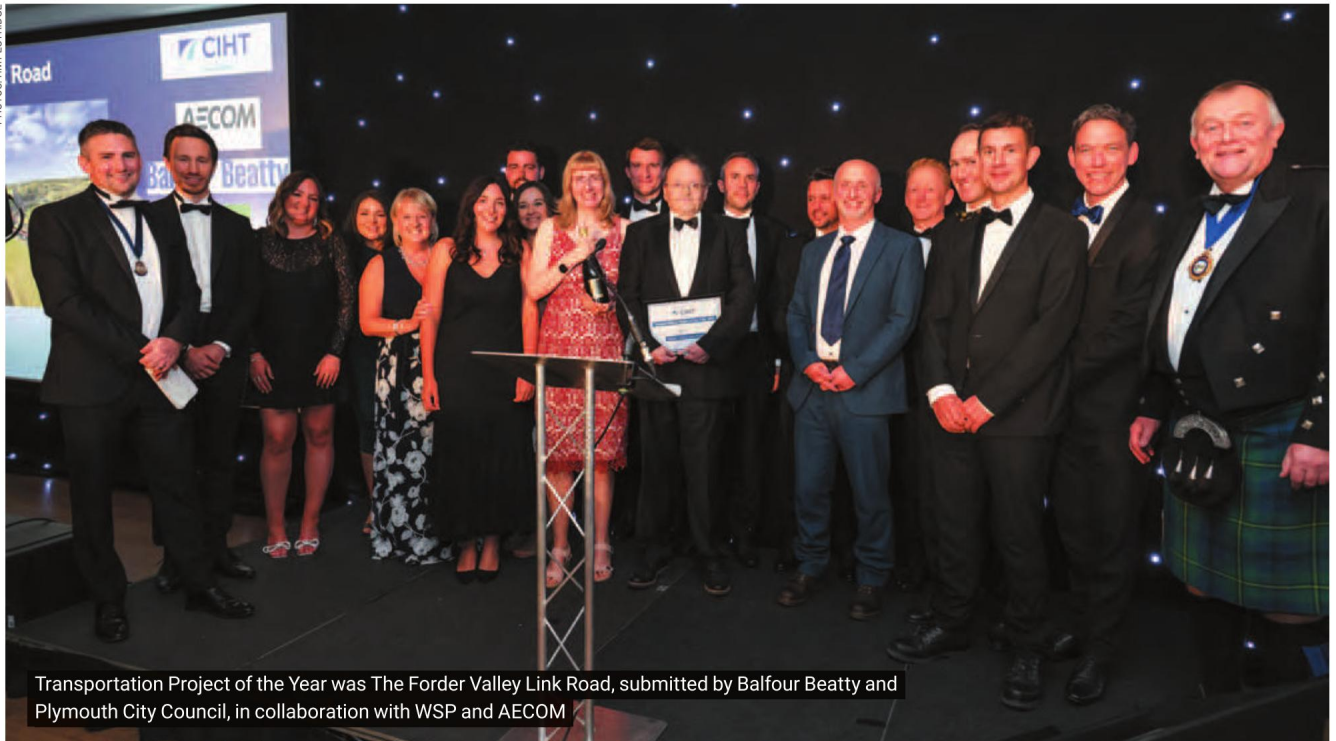
Transportation Project of the Year was The Forder Valley Link Road, submitted by Balfour Beatty and Plymouth City Council, in collaboration with WSP and AECOM